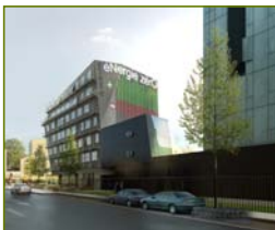
Landy Procession F. H. Jourda, arch.

Her work is highly convincing by its maturity and astonishing rigour , a powerful architectural synthesis between spatial and constructive elements. The innovative use of construction materials and the high design quality makes her contribution to contemporary architecture particularly significant.